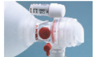
Disposable manometer permits visual control of lung pressure (pediatric and infant versions).