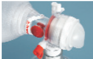
Pressure-limiting valve helps prevent overpressure in the lungs (pediatric and infant versions).

The incorporated handle and SafeGrip™ technology contributes even further to overall comfort, especially during prolonged critical events.