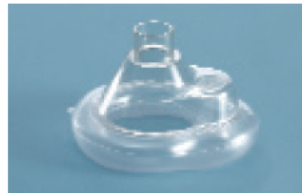
Choice of six convenient mask sizes.