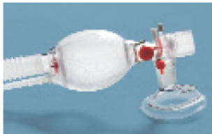
Ambu Spur II infant also available with reservoir tube.

Ambu SPUR II represents a complete family of resuscitators, including infant, pediatric, and adult sizes. All Ambu SPUR II resuscitators come in individual, resealable plastic carrying bags, complete with one or more masks and any special accessories. The bags themselves are color-coded for fast identification of infant, pediatric, and adult sizes.