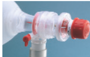
Direct PEEP connection for easy attachment.