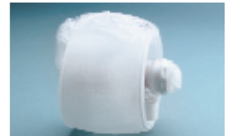
Folds for easy storage.